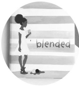
Blended by Sharon M Draper