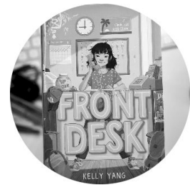
Front Desk by Kelly Yang